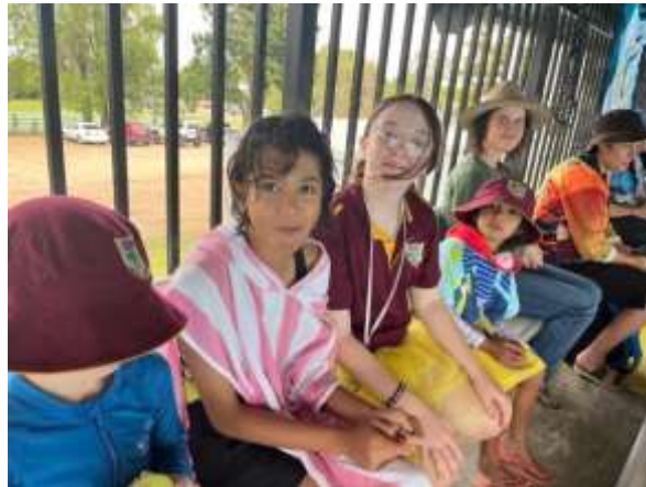
Maidavale rocking the stands!